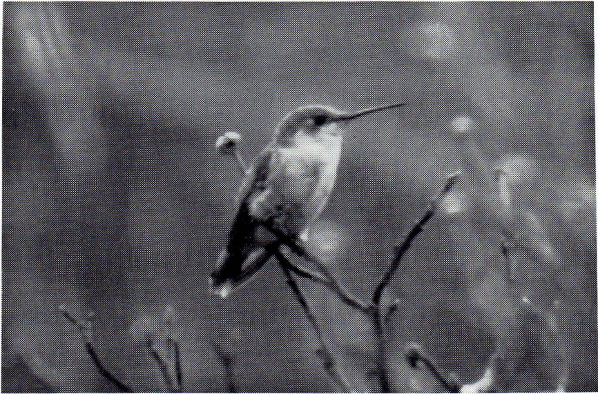
Figure 1. This Calliope Hummingbird overwintered south of Birmingham near Montevallo.